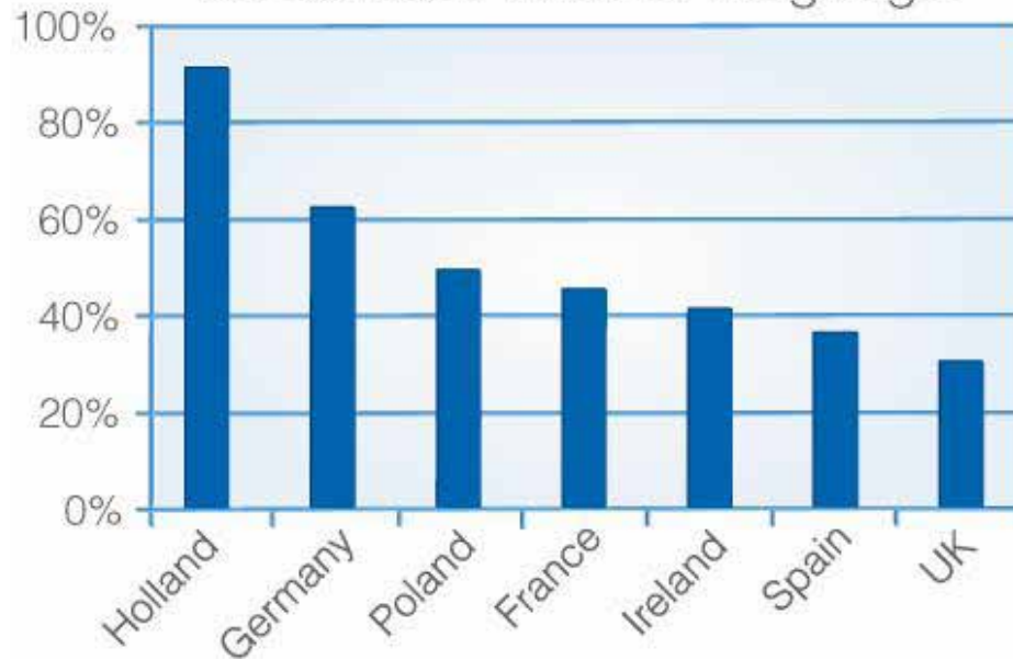
Proportion of population able to converse in another language